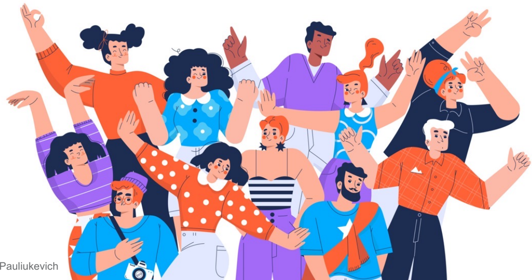
Art by Yuliya Pauliukevich