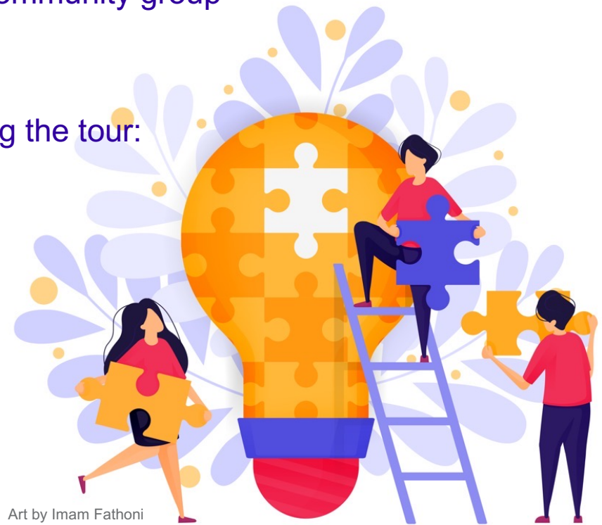
Art by Imam Fathoni