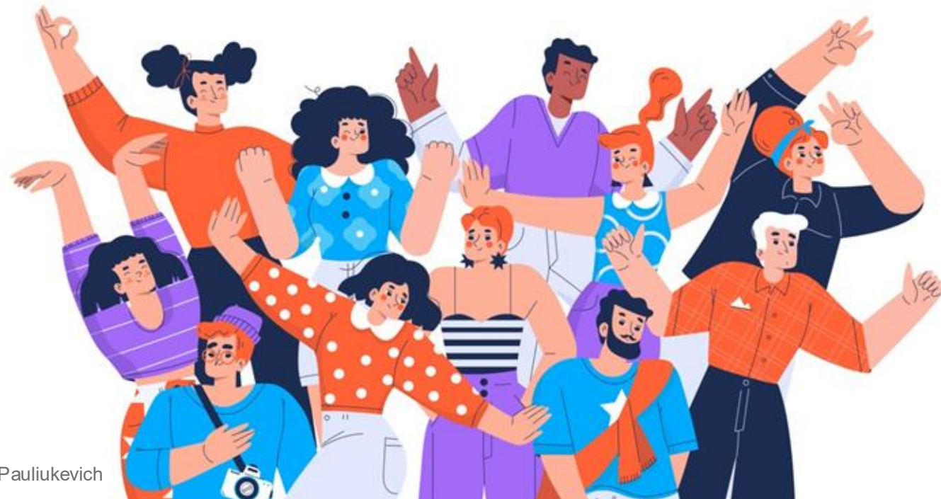
Art by Yuliya Pauliukevich