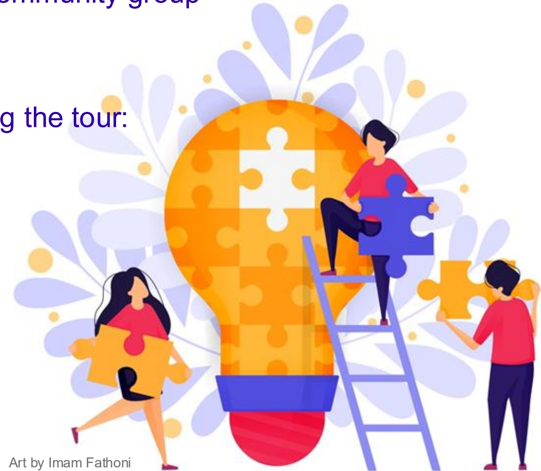
Art by Imam Fathoni